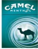
Men FF Kg Box 101537