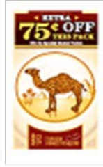
Filter 99s Box 174464