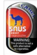
SNUS Robust 105224

0 12300 00068 0 Camel SNUS Winterchill (TIN)