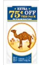
Blue 99s Box 174465