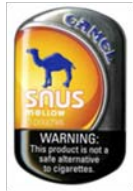
SNUS Mellow 105227