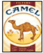
Filter Kg Box 100282