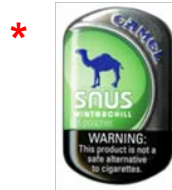
SNUS Winterchill 105222