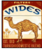
Wides Filter 100298